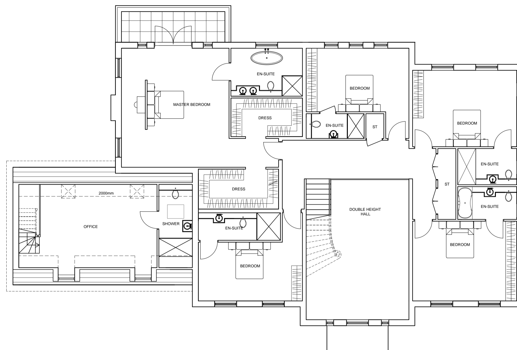
PROPOSED FIRST FLOOR PLAN SCALE 1:100